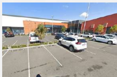
Gippsland Regional Indoor Sports Stadium