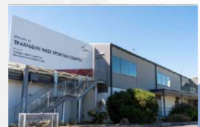
Traralgon West Sports Complex