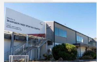
Traralgon West Sports Complex