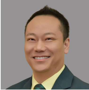
COUNCIL CHAIRPERSON VIN PANG