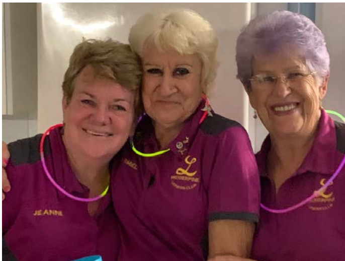
Proserpine hosted a Disability Social Karaoke Night, a great night.