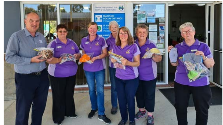
The Tamworth girls presenting the masks they sewed for Meals on Wheels clients.